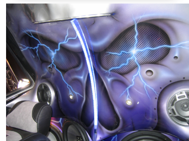
Simon made an incredible painting job !