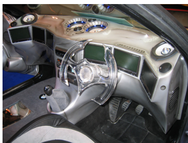
Ready to drive ? Better stay and listen music...

System diagram: 5x MTX TA5601 powering 10x MTX T7512-04 6x MTX TA5302 powering 3x MTX TXC6.1, 5x MTX TXC5.1 and 1x MTX THX502 Power supply: 10 batteries Cables and accessories by StreetWires HU: Alpine with motorized TFT screen 2x Alpine DVD player 1x Alpine Harddrive 8x Alpine 7" screen