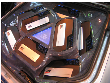
The rack with the 2005 MTX Thunder amps

The entire system was installed by the Audio Advice crew and airbrushed by Simon from SM Designs. The car has a Sound Quality setting for audiophile listening and another a complete 5.1 Surround setting for movies. For the Ultimate Bass experience the third setting in the car is an everything goes Bass Demo. The car can be operated by the Headunit in the dash controlling 2 DVD players and a Hard Drive or it can be operated from outside the car through a lap top computer.