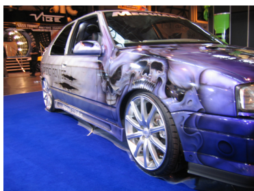
The famous R19