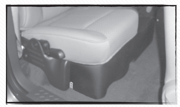
Make all final wire connections (See Page 2) and fold the seat down. Your installation is complete. Enjoy your new bass in a small space.