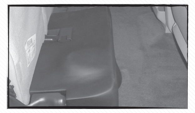
Flip up the passenger side rear seat and place the enclosure on the floor as shown above.