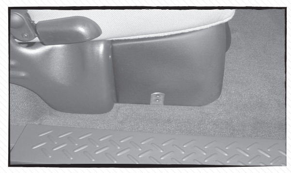
Attach the mounting bracket to the enclosure as shown using (2) 2" screws to attach the bracket to the floor, and (1) M6 bolt to attach the bracket to the enclosure.