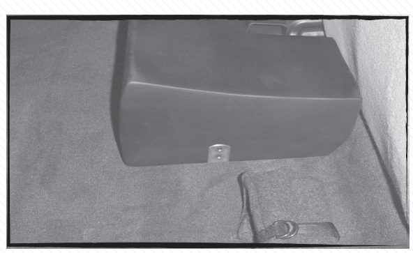
From the driver side, attach the second bracket to the enclosure as shown. Use the same screws from Step 2.