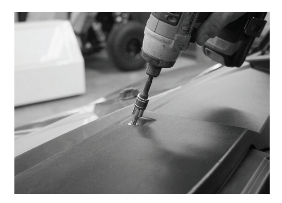
Step 2 - Remove the two (2) trim panel pin rivets found on either side of the dash cover.

Step 1 - Remove the two (2) T40 screws found in the top dash cover.