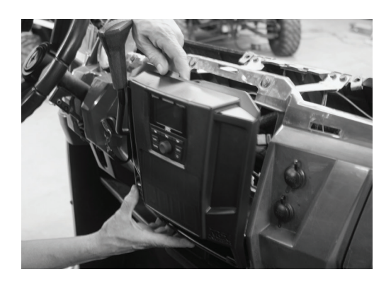
Step 7 - Reconnect any switches or wiring harnesses and insert the radio and dash kit assembly into the dash opening.

Note: This dash kit also offers space to mount additional rocker panel switches for accessories. On the rear of the dash kit, grooves are provided to give you proper location and size for mounting.