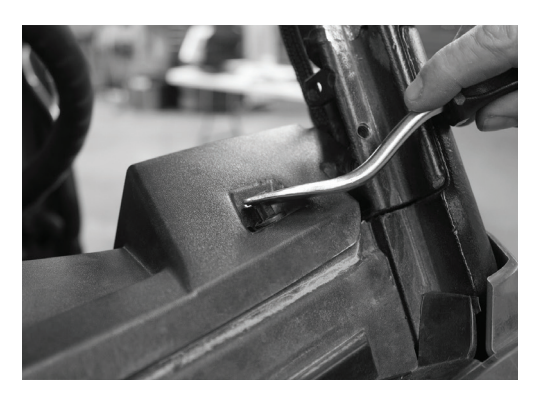
Step 3 - Lift and pull back the top dash cover to release the clips holding it in place.